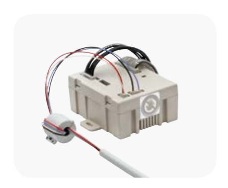
Piezo built-in kit For installation in your existing dental unit.