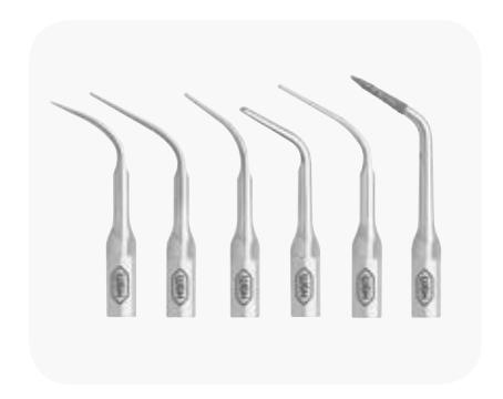
Large tip range Best results in endodontics, prophylaxis, periodontology and micropreparation.

Pyon 2: the LED piezo scaler for scaling, periodontology, endodontics and micropreparation. With Pyon 2 you can be sure of achieving optimal results in all applications, as the LED ring in the handpiece allows thorough, precise working. This is helpful both for removing interdental calculus and expanding the root canal entrance.