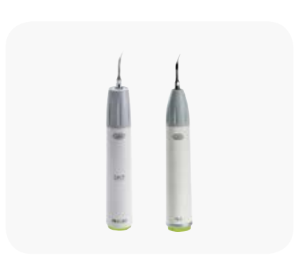
Two versions The Pyon 2 handpiece is available with a 5x LED ring or without light.