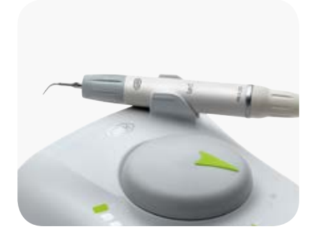
Ergonomic design The shape of the handpiece and its light weight allow you to work for longer without tiring.